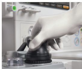
Quick Release APL Valve