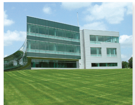
Mindray North America Headquarters Mahwah, NJ

For more information about Mindray products and services, visit www.mindray.com .