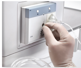
Integrated Gas Analysis

Visible indication of patient initiated breath