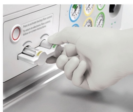
Back-up Flow Control System