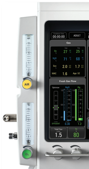
O 2 /Air Mixer