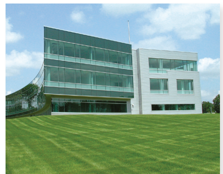
Mindray North America Headquarters Mahwah, NJ

For more information about Mindray products and services, visit www.na.mindray.com .